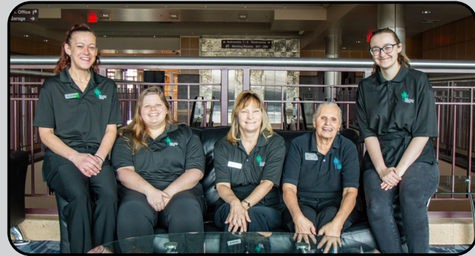
(Some Not Pictured)

Our servers play a vital role in making your experience memorable! Their professionalism, dedication, and attention to detail are essential in upholding our standards of being of service to you! They always have a positive attitude to make you feel right at home. From taking your orders to serving your favorite dishes with a smile, our servers go above and beyond to exceed your expectations!